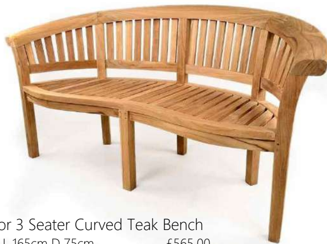
Windsor 3 Seater Curved Teak Bench H 88cm L 165cm D 75cm £565.00