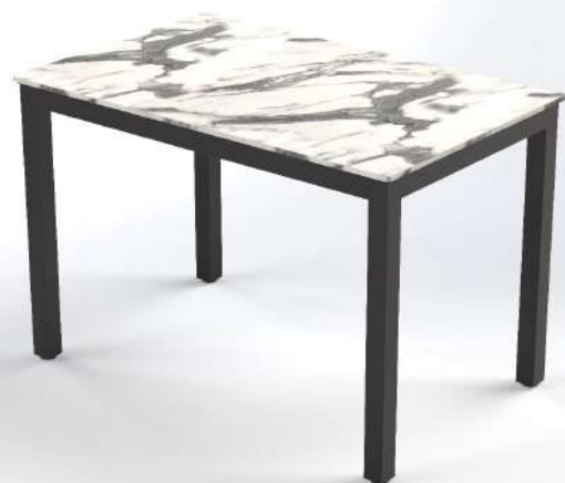
Box Base Table with White Marble Top 110 x 70 cm £215.00