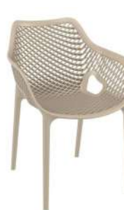
Rowner Arm Chair Taupe

BOX BASE TABLE WITH I SOTOP ADVANTAGE TOPS