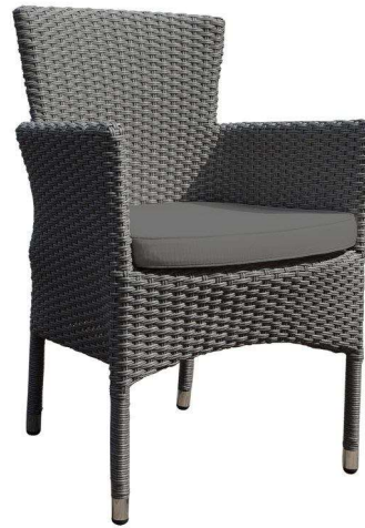
Oasis Stacking Armchair Filled Sides With seat cushion L 58cm D58cm H83cm