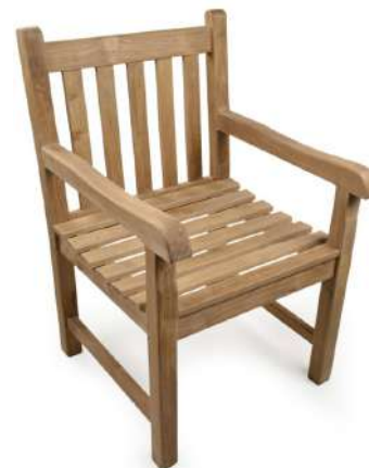
Warwick Teak Arm Chair