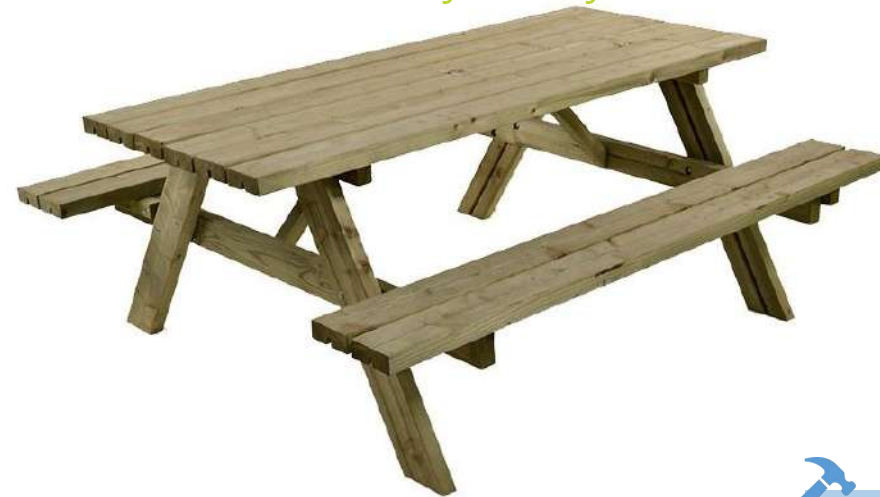
Foster Heavy Duty 8 Seater Picnic Bench