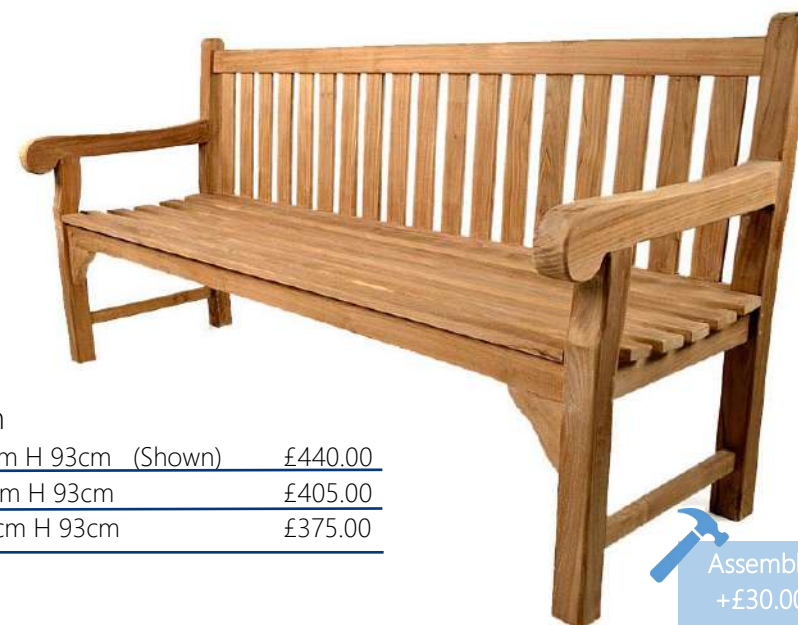
Queensbury Teak Bench

4 seater 1.8m L 180cm D 70cm H 93cm (Shown) £440.00