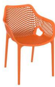
Rowner Arm Chair Orange