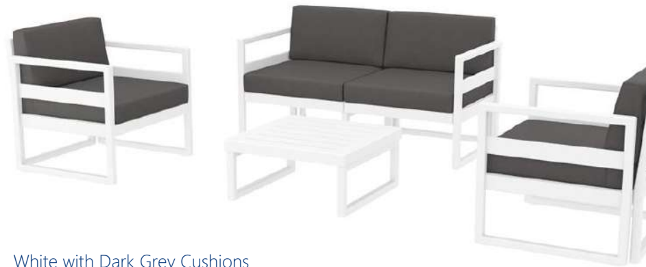
White with Dark Grey Cushions