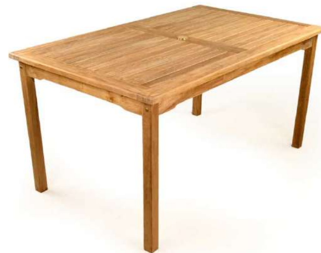
Bistro Teak Rectangular Table