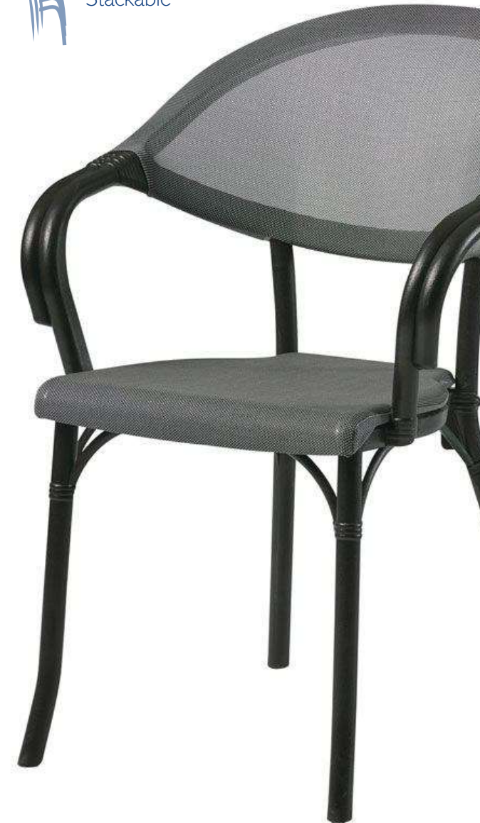
Selva Arm Chair – Taupe Taupe Frame with Taupe Seat & Back W 43cm D53cm H83cm £129.00