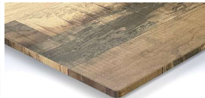
Rustic Maple Top

A cigarette can be left to burn itself out without leaving a mark on the surface.