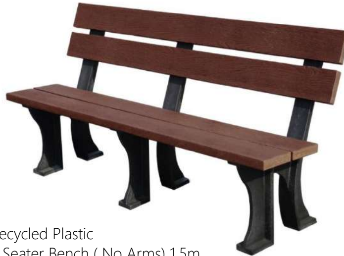
Recycled Plastic 3 Seater Bench ( No Arms) 1.5m H 80cm L 150cm D 61cm £335.00