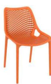
Rowner Side Chair Orange