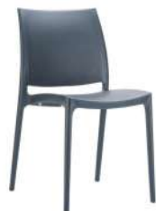
Elson Side Chair Grey