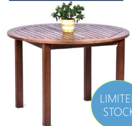
Malden Round Table DIA 110cm £195.00