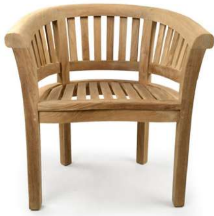
Windsor Teak Chair H 82cm L 70cm D 60cm £245.00

Made from premium quality grade 'A' teak. Synonymous with longevity, it is a dense close-grained hardwood which is high in natural oil content. These qualities enable the wood to withstand exposure to extreme weather conditions. All joints are mortise and tenon secured with dowels. Left untreated the teak will turn silver grey.