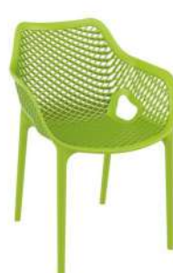
Rowner Arm Chair Tropical Green