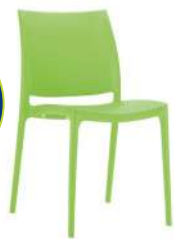
Elson Side Chair Green