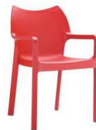
Brockhurst Side Chair Red