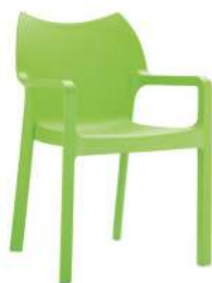
Brockhurst Side Chair Tropical Green