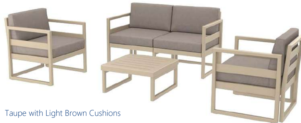
Taupe with Light Brown Cushions