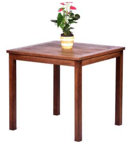
Malden Square Table L 80cm D 80cm £135.00