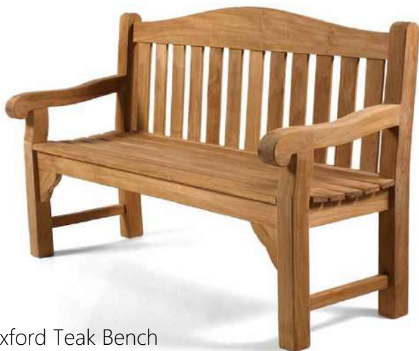
Oxford Teak Bench