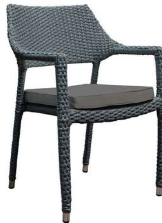
Oasis Stacking Arm/Side Chair With seat cushion L 58cm D60cm H85.5cm