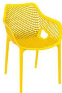
Rowner Arm Chair Yellow