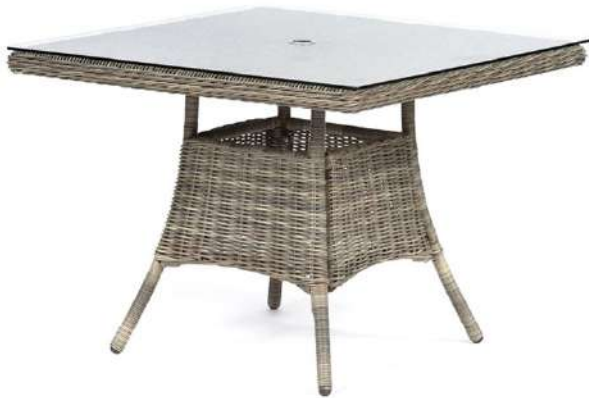
Regent Rattan Square Table