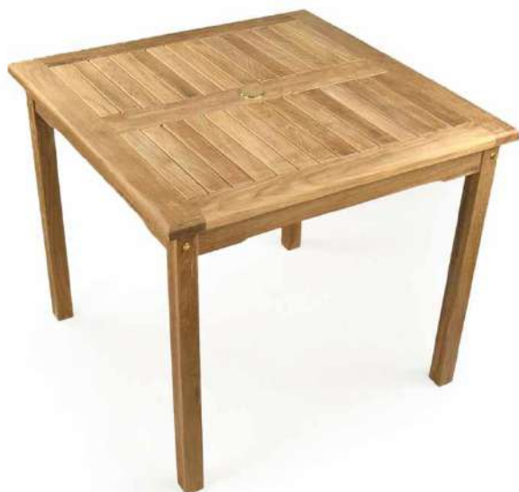
Warwick Teak Square Table