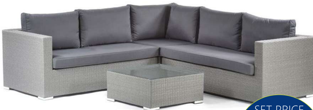
Oasis Corner Sofa Set