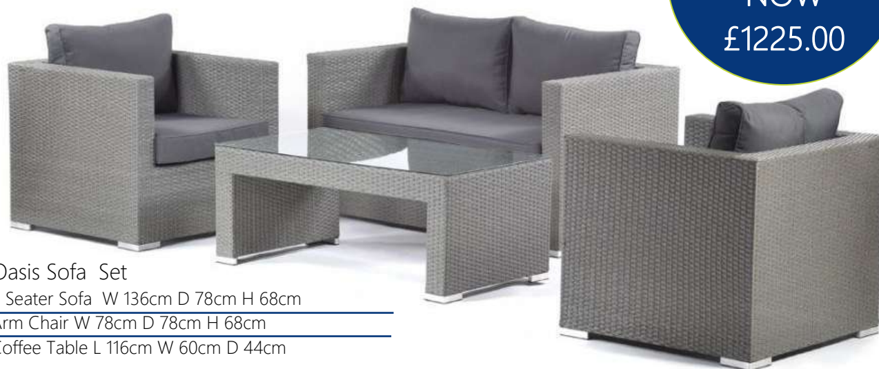
Oasis Sofa Set

Our high quality products are excellent value for money, this range is suitable for both a commercial setting or a home garden.