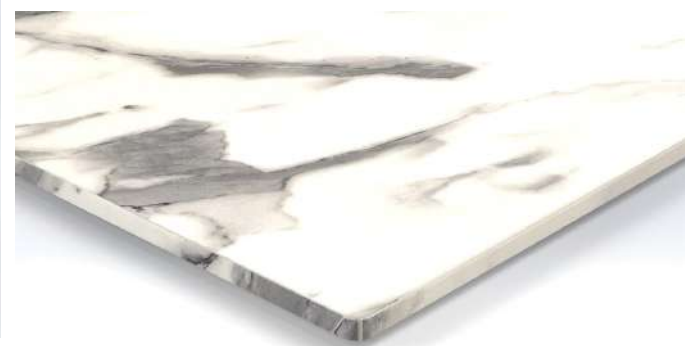
White Marble Top