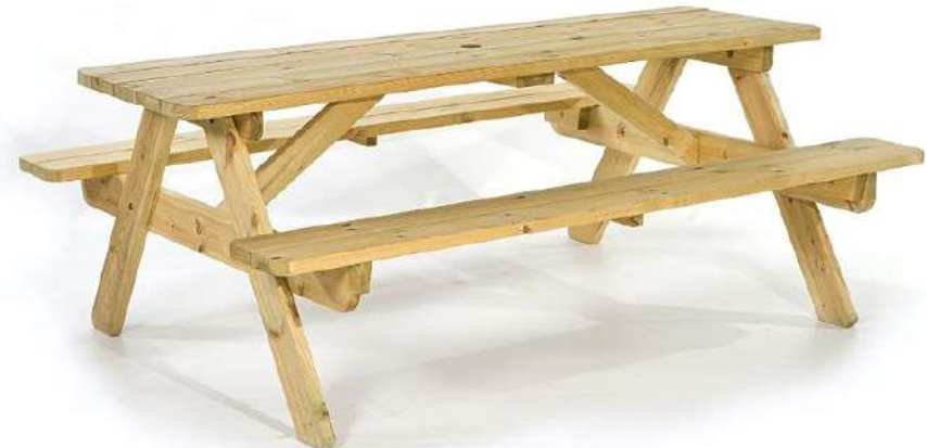
Jersey 6 Seater Picnic Bench