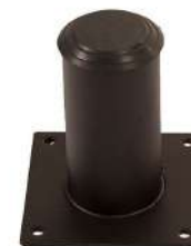
Parasol Cup H 11cm D 10cm W 10cm