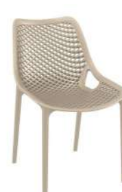
Rowner Side Chair Taupe