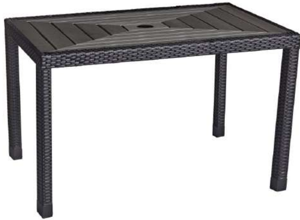
Oasis Rectangular Rattan Table with Polywood Top 120 x80xm H 75cm