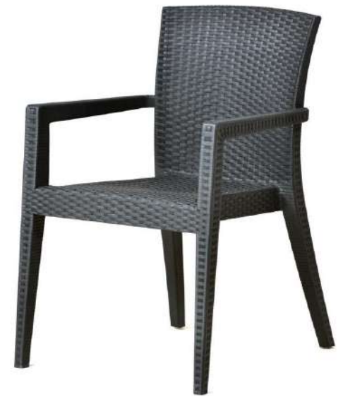
Madrid Stacking Arm Chair L 80cm D63cm H88cm £79.00