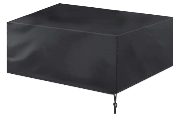
Waterproof Outdoor Furniture Cover for Rattan Furniture