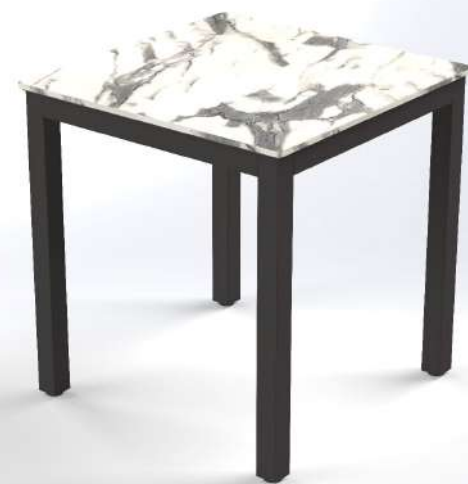
Box Base Table with White Marble Top 80 x 80 cm £179.00