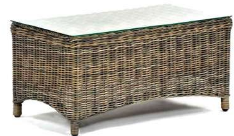
Regent Rattan Coffee Table