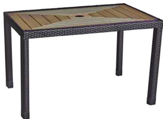
Denby Rectangular Rattan Table with Polywood Top