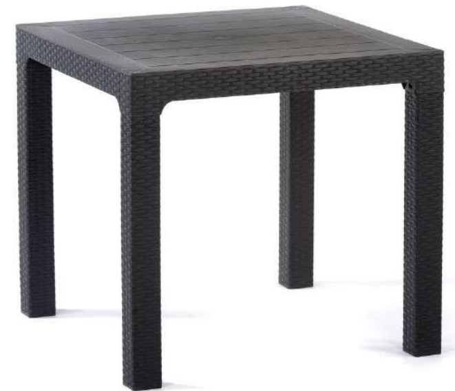
Madrid Square Rattan Table 90 x90xm H 75cm £235.00 80 x80xm H 75cm £125.00