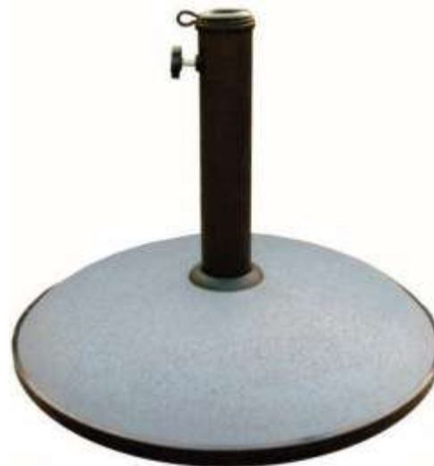
Parasol LB Base DIA 40cm 15kg