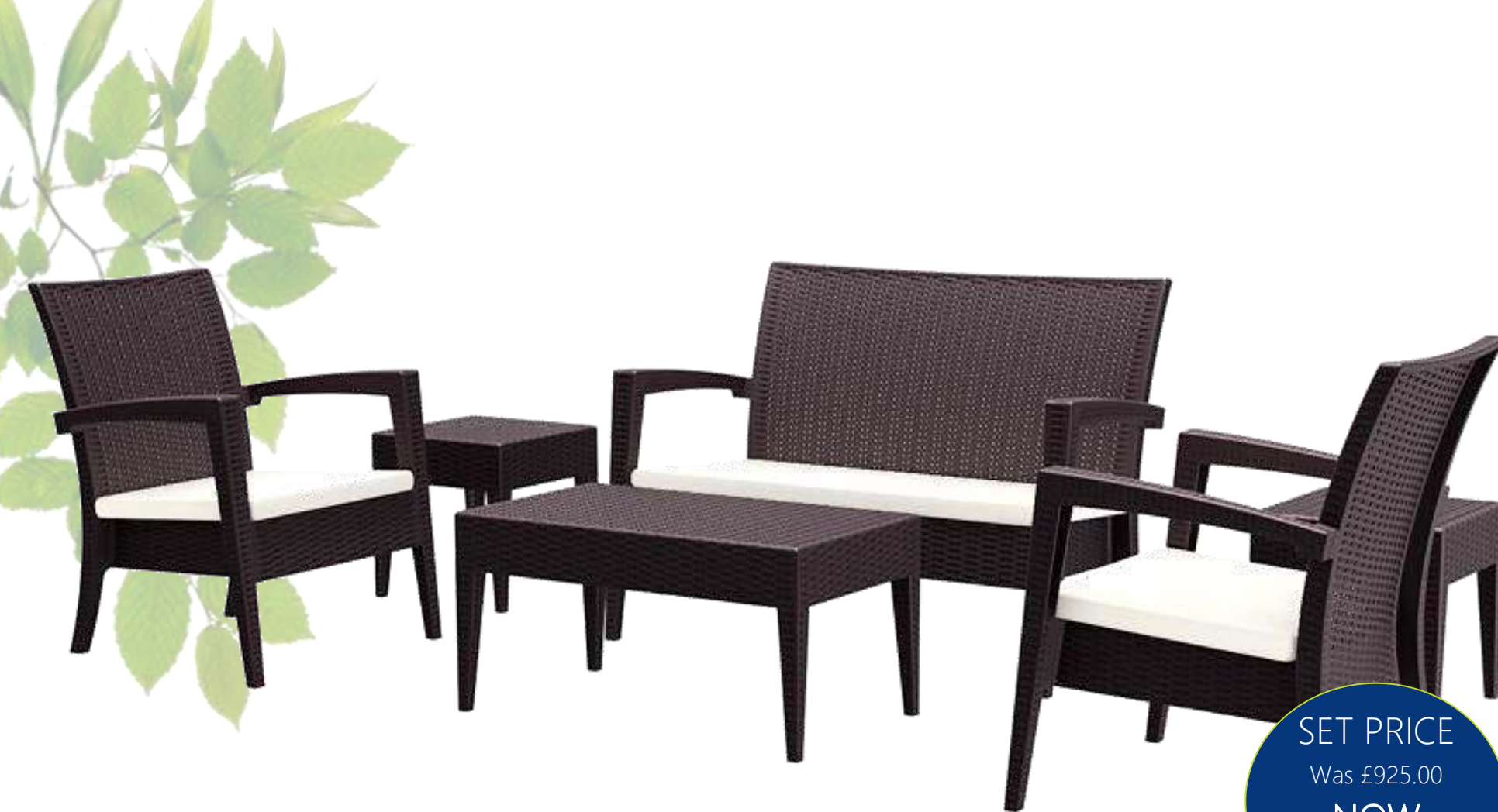
Miami Lounge Set –Brown