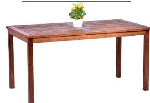
Malden Rectangular Table L 150cm D 80cm £215.00