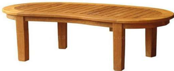
Windsor Teak Coffee Table H 50cm L 120cm D 60cm £225.00