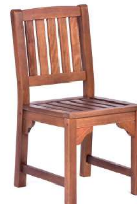
Malden Side Chair H 89cm L 44cm D 53cm £95.00