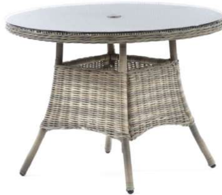
Regent Rattan Small Round Table