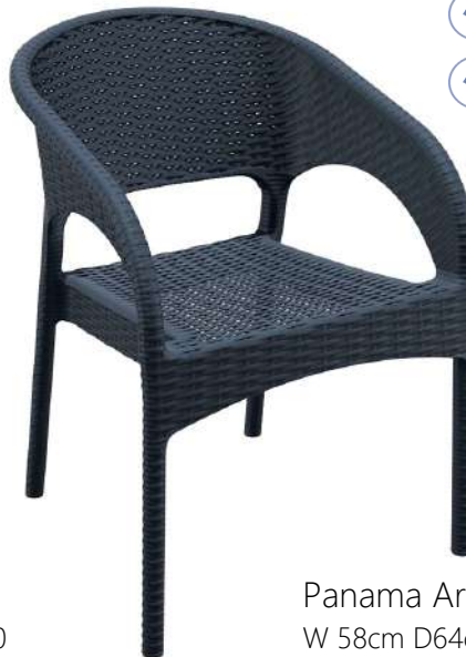
Panama Arm Chair – Brown W 58cm D64cm H80cm £89.00