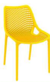
Rowner Side Chair Yellow