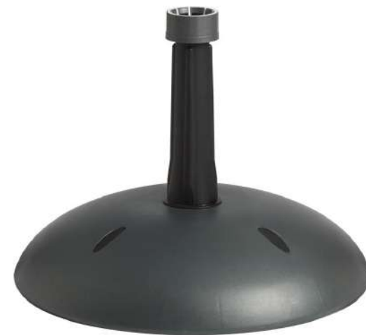
Olympia Parasol Z Base Black DIA 45cm 20kg