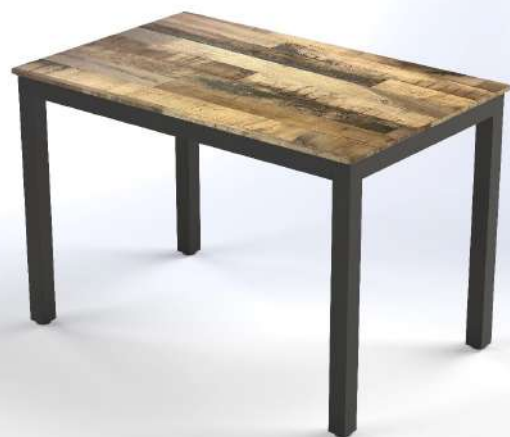
Box Base Table with Rustic Maple Top 110 x 70 cm £215.00