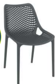
Rowner Side Chair Dark Grey