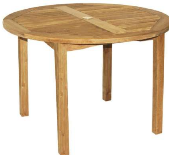
Teak Square Table