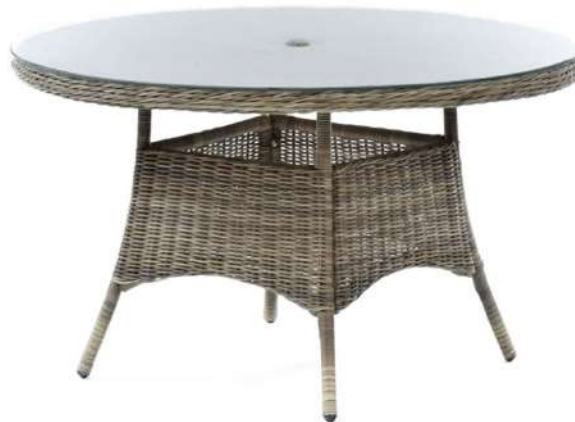
Regent Rattan Large Round Table