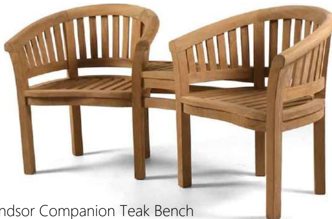
Windsor Companion Teak Bench H 82cm L 170cm D 70cm £595.00