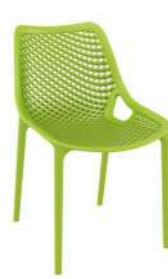
Rowner Side Chair Tropical Green