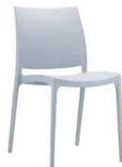
Elson Side Chair Silver