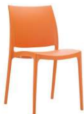
Elson Side Chair Orange