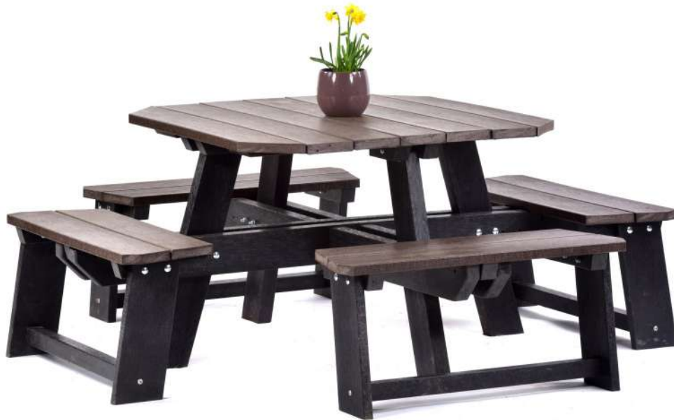
Square Plastic Bench Brown H 73cm DIA 185cm