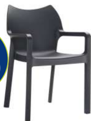
Brockhurst Side Chair Black