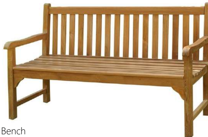
Warwick 3 Seater Bench