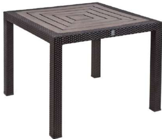
Oasis Square Rattan Table with Polywood Top 90 x90xm H 75cm