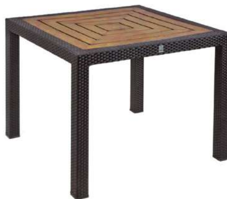
Denby Square Rattan Table with Polywood Top