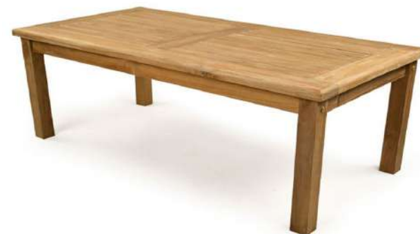
Sutton Teak Rectangular Coffee Table