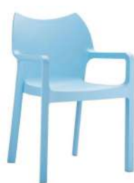
Brockhurst Side Chair Light Blue