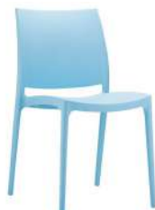
Elson Side Chair Light Blue