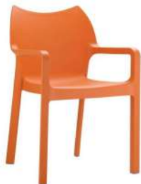
Brockhurst Side Chair Orange