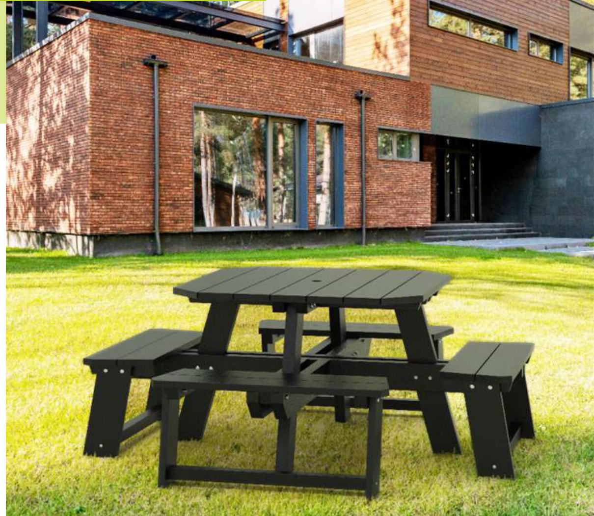
Square Plastic Bench Black H 73cm DIA 185cm