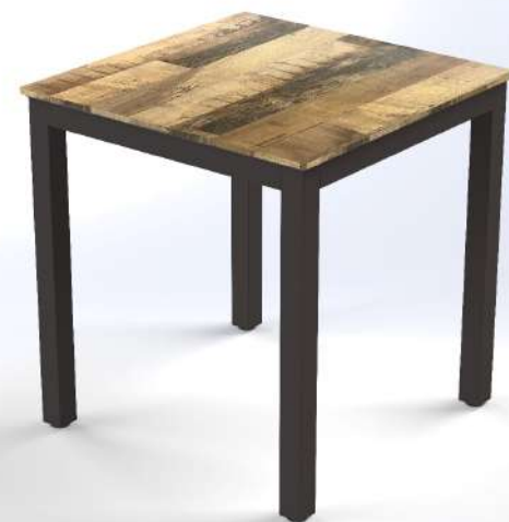
Box Base Table with Rustic Maple Top 80 x 80 cm £179.00

BOX BASE TABLE WITH I SOTOP ADVANTAGE TOPS