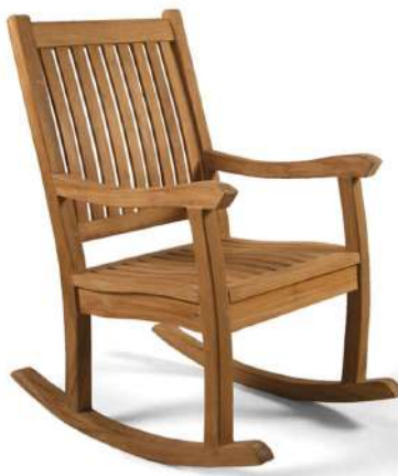
Premium Teak Rocking Chair