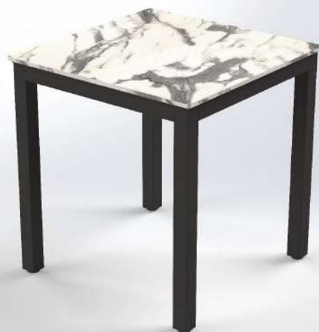
Box Base Table with White Marble Top 80 x 80 cm £179.00