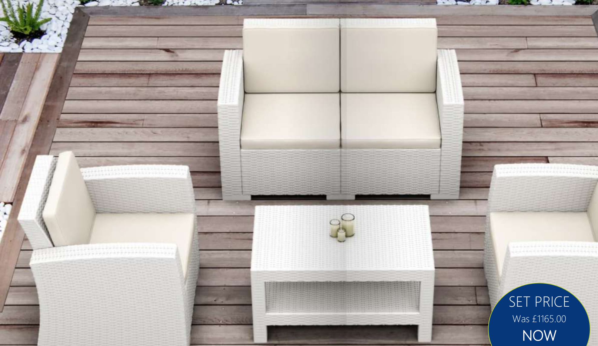
Monaco Lounge Set –White