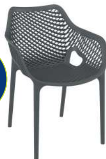
Rowner Arm Chair Dark Grey