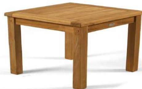
Sutton Teak Square Coffee Table