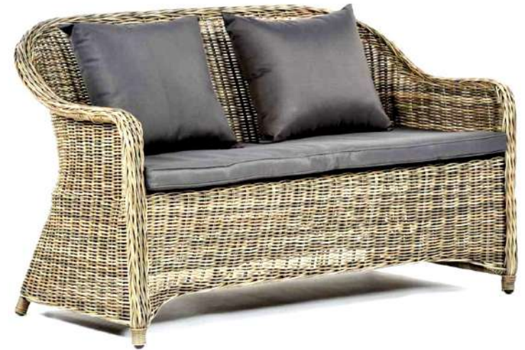
Regent 2 Seater Rattan Chair