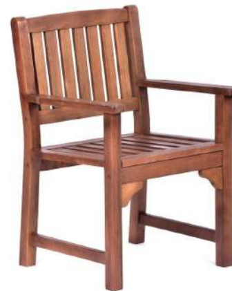
Malden Arm Chair H 69cm L 61cm D 56cm £110.00